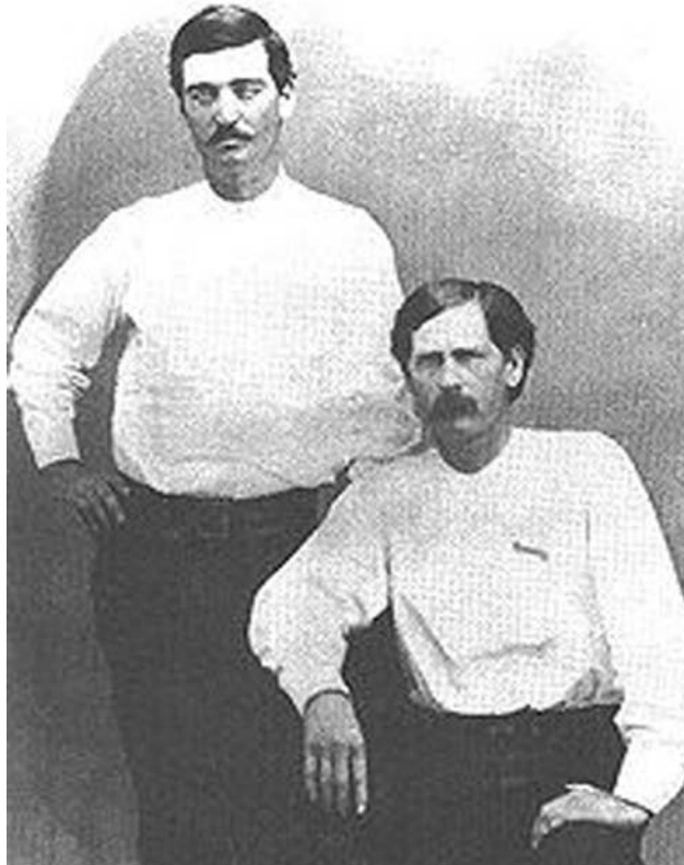
Bat Masterson and Wyatt Earp, 1876