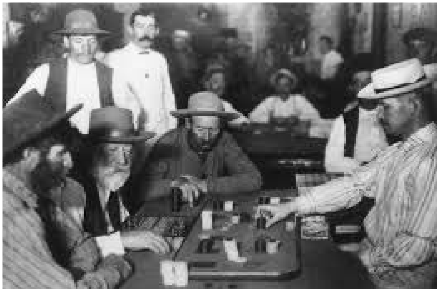
Faro game in Morenci, Arizona, 1895